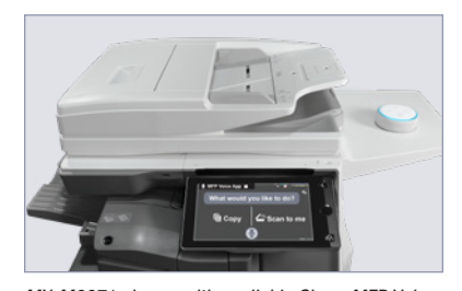
MX-M6071 shown with available Sharp MFP Voice feature with Alexa.