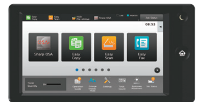
Award-winning 10.1" (diagonal) customizable touchscreen display.