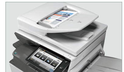
Sharp's ImageSEND™ feature provides one-touch distribution to email, cloud applications and more.