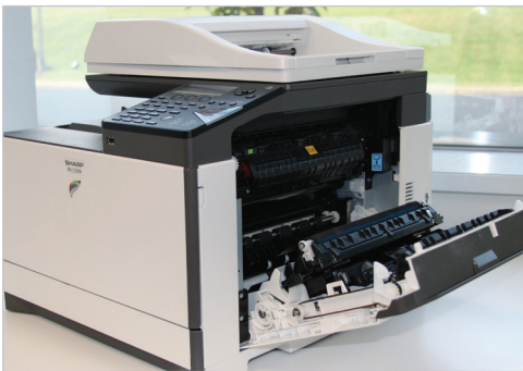
Convenient access to paper path from side panel door makes it easy to clear misfeeds.