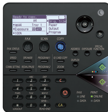
MX-C300W control panel.