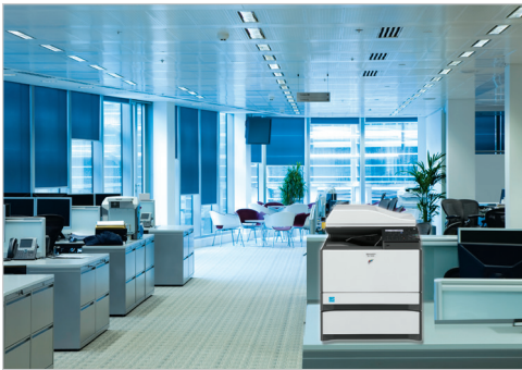
Compact yet powerful enough for workgroup environments.