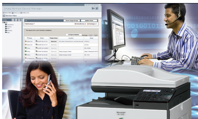
Sharp Remote Device Manager