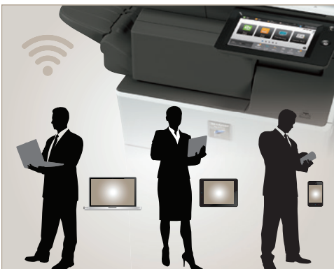
Built-in wireless network interface for convenient scanning and printing from mobile devices.

From paper handling to networking, the MX-B355W and MX-B455W Advanced Series desktop monochrome document systems will exceed your expectations.