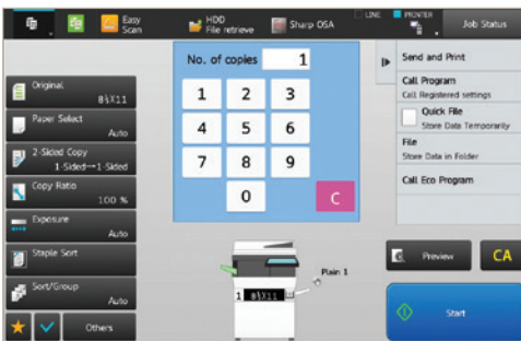
Standard Copy Screen offers more advanced features.