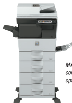
MX-B455W shown with compact inner finisher and optional paper trays.

When it’s time to get the job done, the MX-B355W/B455W are outstanding performers. Quickly scan documents at speeds up to 110 images per minute (MX-B455W) . Built-in optical character recognition (OCR) can convert your scanned documents into text-searchable PDFs or Microsoft Office file formats, simplifying your workflow. An available compact inner finisher with three position stapling can give your documents a professional look.