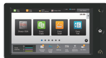
Award-winning 10.1" (diagonally measured) customizable touchscreen display.