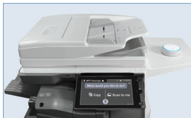
MX-4071 shown with available Sharp MFP Voice feature powered by Alexa.