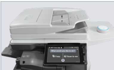
MX-M6071 shown with available Sharp MFP Voice feature with Alexa.