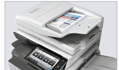
Sharp's ImageSEND™ feature provides one-touch distribution to email, cloud applications and more.