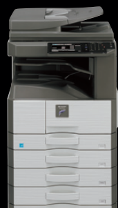
The MX-M316N shown with job separator.