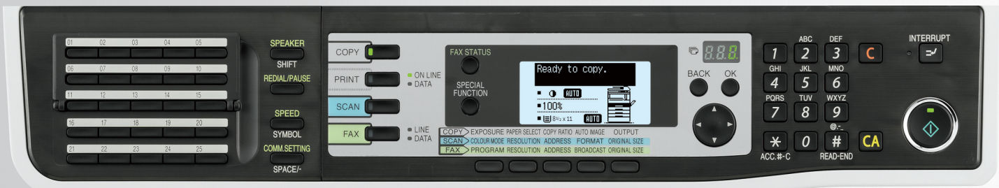
MX-M232D Control Panel.

Maximize capabilities of your MX-M232D with optional full-color network scanning and feature rich network printing! With simple plug-and-play operation, the optional full-featured Network Expansion Kit offers PCL6 and PS3 network printing, walk-up scanning, web-based device management and more. With Sharp's easy-to-use utilities and driver software, the versatile MX-M232D can easily integrate into an existing network environment.