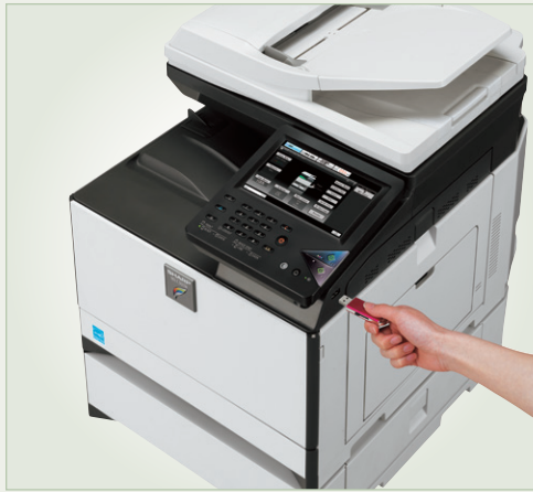
An easily accessible USB connector allows for simplified printing of PDF files from common USB thumb drives.