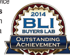
Outstanding Achievement In Innovation Cloud Portal Office

Cloud Portal Office is a comprehensive document storage and sharing service that provides a convenient way to seamlessly connect to your business content and easily share and collaborate with team members.* You can also capture, index and archive both paper and electronic documents in a single repository. Most importantly, IT administrators can manage and control user access in order to safeguard company data.