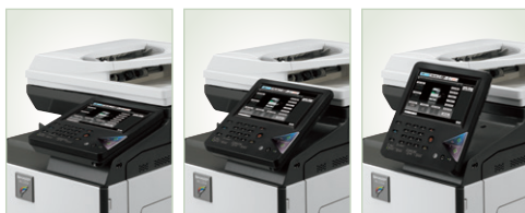
Multi-position tilt screen allows for adjustment to a convenient viewing position.