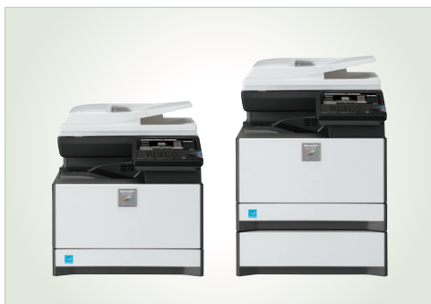
Expandable paper capacity stores up to 800 sheets.