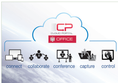
Work more efficiently and collaborate more easily with Sharp Cloud Portal Office.