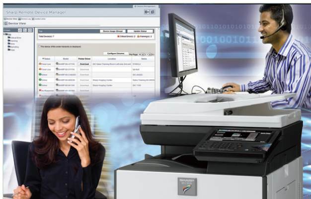
Sharp Remote Device Manager.

SRDM is a device management application, developed by Sharp, which allows the operator to browse and operate an MFP via a web browser . This advanced access allows for easy setup and configuration of the MFP, enabling users to get the most of the advanced features the MX-C301W has to offer!